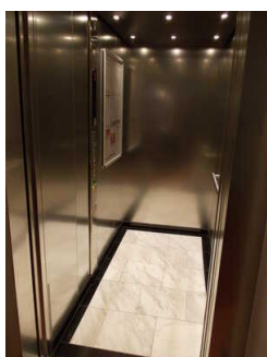
Lift to the room floors 1-5