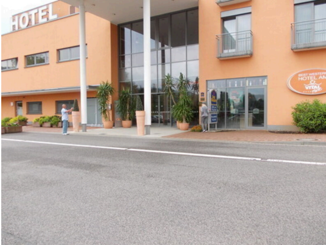
Hotel am Vitalpark | ©Denis Puffky