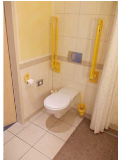
Toilet bathroom for people with disabilities