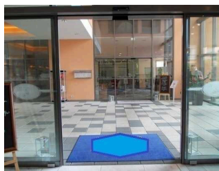
Automatic door to the reception