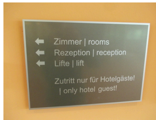
Visual tactile design and signposts