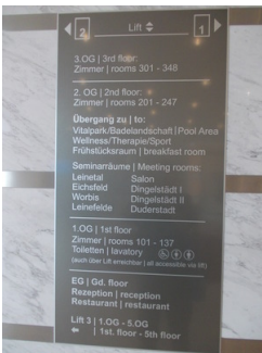
Visual tactile design and signposts