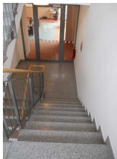
Stairs all floors alternative to lift all floors