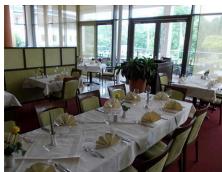
Dining area Theodor Storm