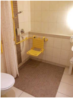
Shower in the bathroom for people with disabilities