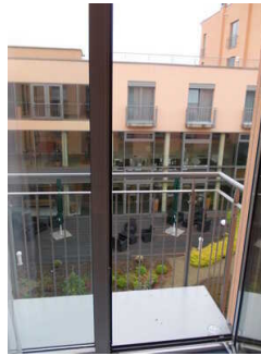
Balcony at the bedroom room no. 328