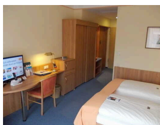
Bedroom Room No. 328