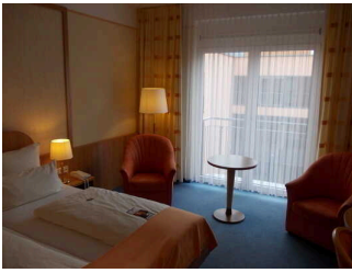
Bedroom Room No. 328