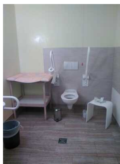
Public toilet for people with disabilities