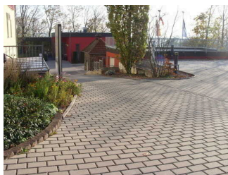
Ways to hotel entrance

We have put together some photos from the company / offer for you. You can find more photos in the detailed reports.