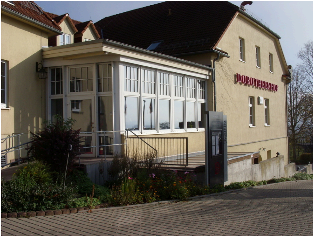
Entrance Consumption Hotel Dorotheenhof Weimar