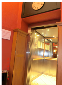
Side entrance restaurant and room 112 with lift