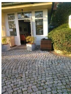
Side Entrance Restaurant and Room 112