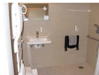
Bathroom room 112