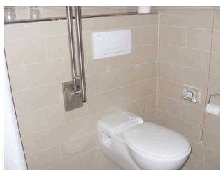
Bathroom room 112