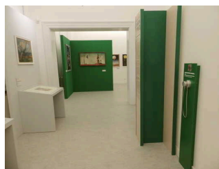
Exhibition KUNSTLAND Thüringen upper floor - Listening station