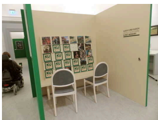
Exhibition KUNSTLAND Thüringen upper floor - Action corner Memory