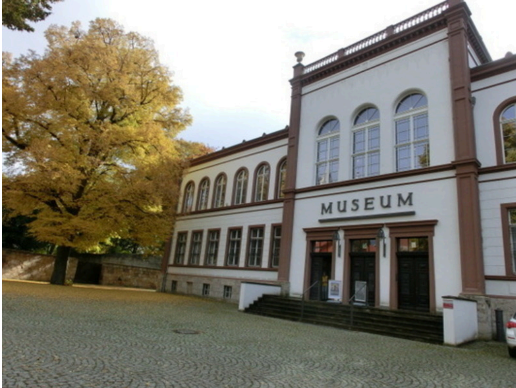
Cultural History Museum at Mühlhausen