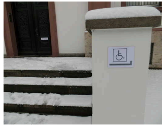
Museum entrance with steps - note on side entrance