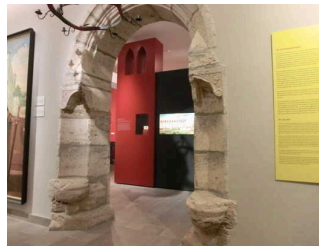
Passage and text panel on the exhibition's circular route on the ground floor