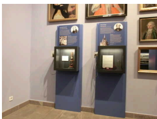
Exhibition on the ground floor - listening stations