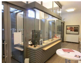
Museum box office and information - 6 steps to the ticket office