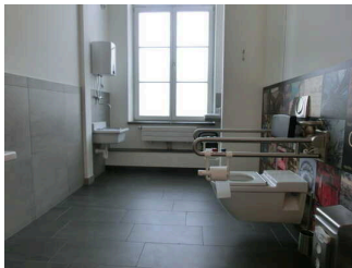
Public toilet for people with disabilities