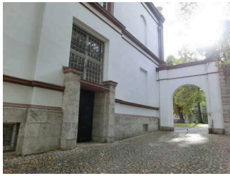
Path from Lindenbühl car park with gateway to side entrance with lift

We have put together some photos from the company / offer for you. You can find more photos in the detailed reports.